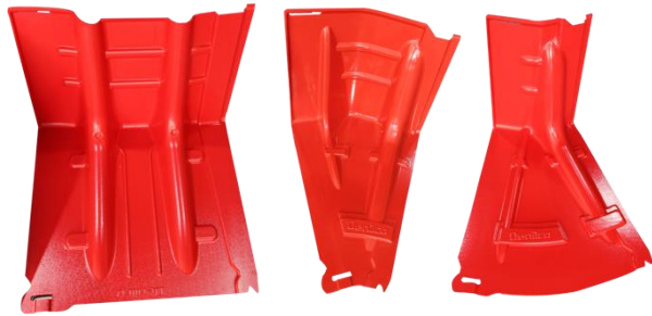
SIMPLE, MODULAR PIECES